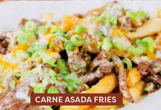
CARNE ASADA FRIES