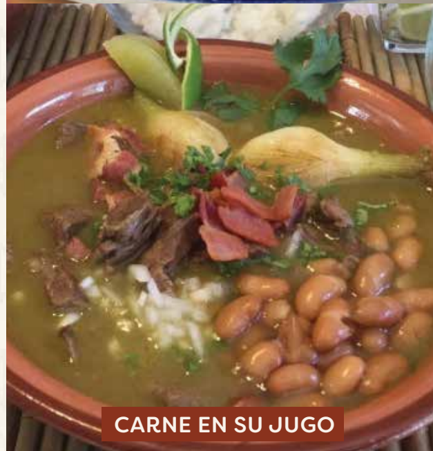
CARNE EN SU JUGO

Two fried or soft flour tortillas filled with shredded chicken or beef tips and topped with melted cheese, red sauce, lettuce, tomatoes and sour cream. Served with rice or beans – 12.50