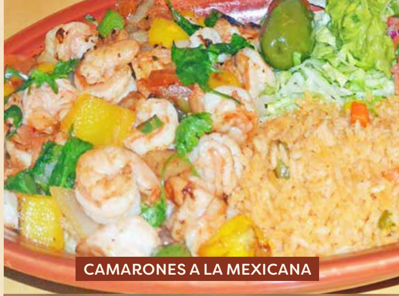
CAMARONES A LA MEXICANA

Three flour tortillas filled with grilled tilapia strips or grilled shrimp, topped with red cabbage, pico de gallo and our homemade chipotle sauce. Served with rice and beans – 13.50