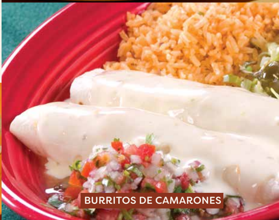
BURRITOS DE CAMARONES