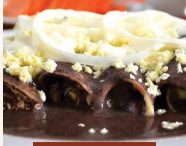
ENMOLADAS DE POLLO

Three grilled shrimp enchiladas topped with melted cheese, cilantro and drizzled with chipotle sauce. Served with rice and pico de gallo – 12.75