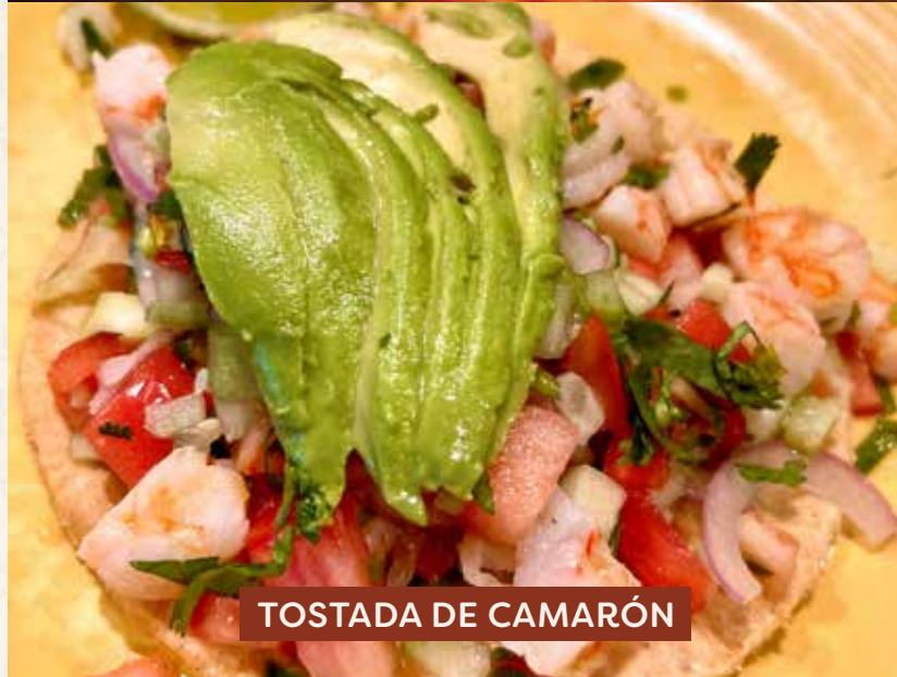
TOSTADA DE CAMARÓN