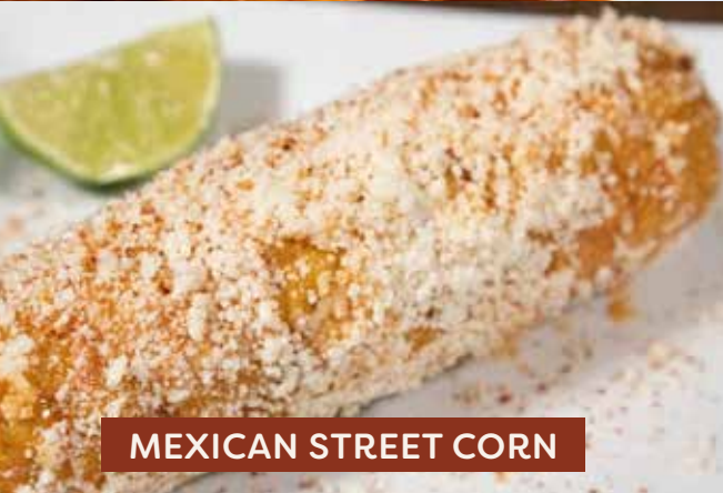
MEXICAN STREET CORN