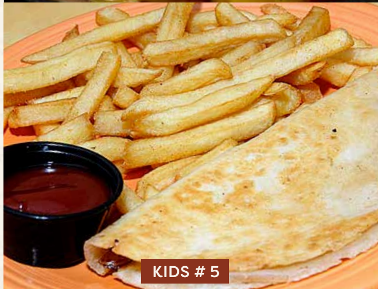
KIDS # 5

Filled with ground beef or shredded chicken, lettuce, cheese, sour cream and tomatoes. (1) - 3.50 (3) - 9.25