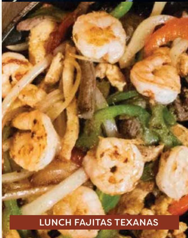
LUNCH FAJITAS TEXANAS