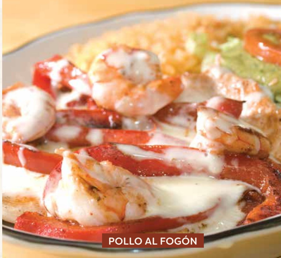
POLLO AL FOGÓN

Grilled chicken strips on a bed of rice with mushrooms and spinach, topped with melted cheese – 12.50